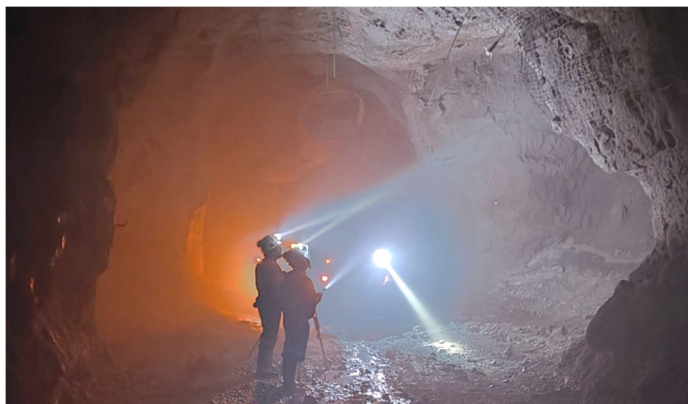
Figures 1 & 2: Roof bolting and inspection of work by Cosalá staff at EC120, following a record year for the operation.